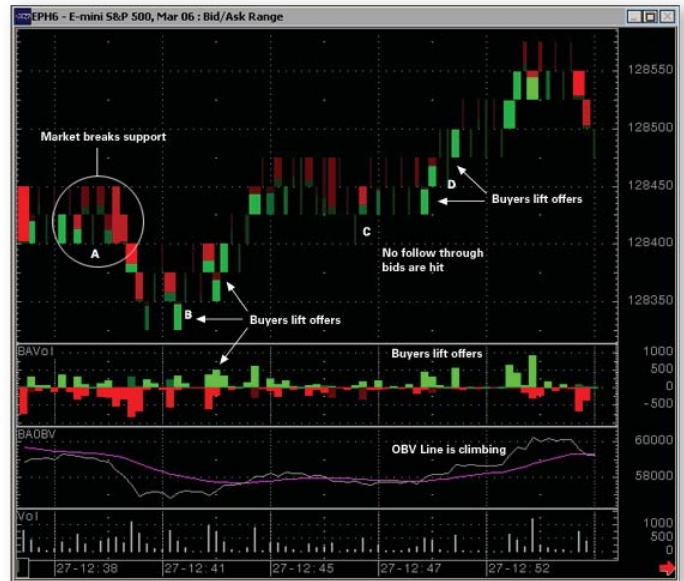
E-mini S&P 500 futures contract using TradeFlow bars, TradeFlow Volume and TradeFlow On-balance Volume line with a 20-bar exponential moving average.