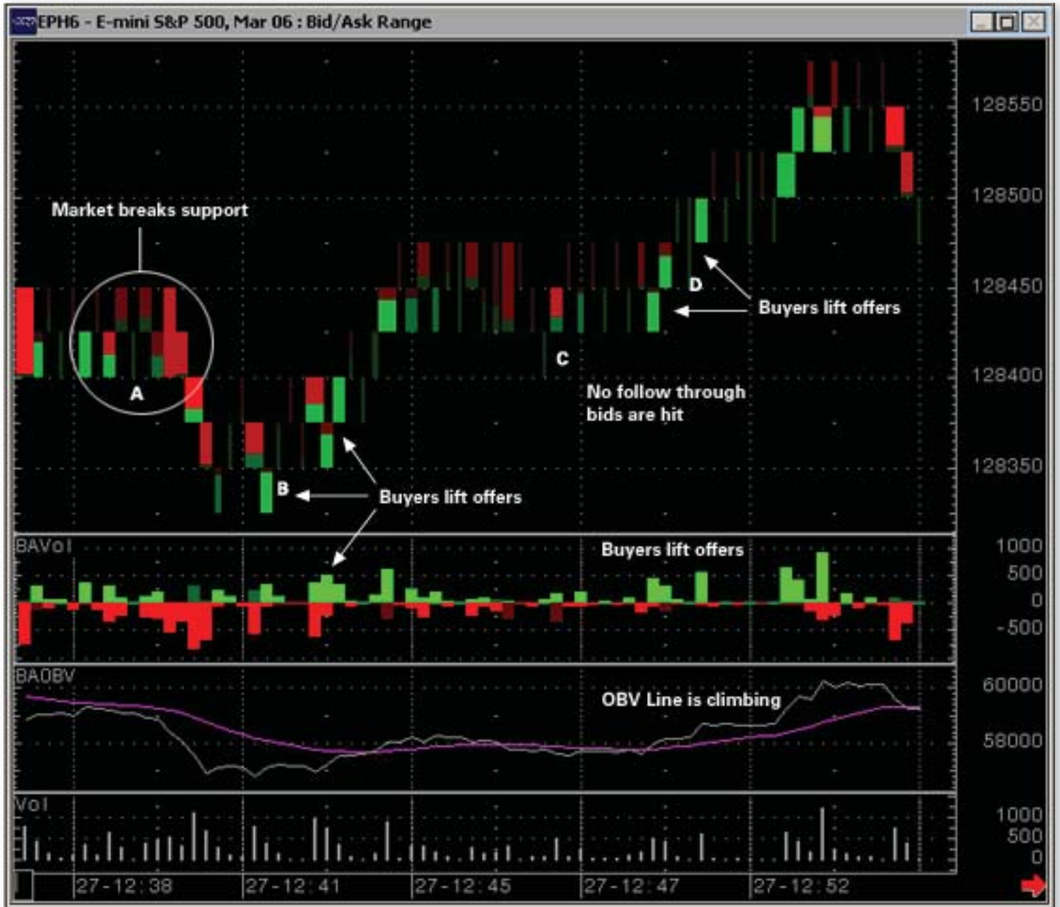
E-mini S&P 500 futures contract using TradeFlow bars, TradeFlow Volume and TradeFlow On-balance Volume line with a 20-bar exponential moving average.